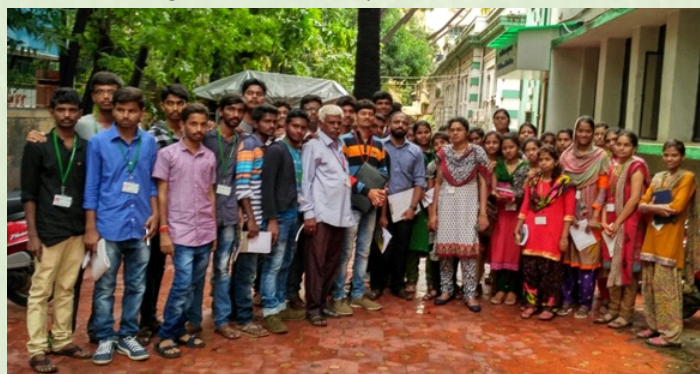
Students from School of Agricultural Sciences and Forestry, Rai Technology University, Bengaluru.