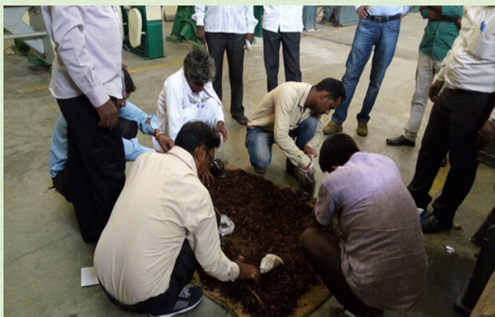
Participants during hands-on-training on oyster mushroom seed bed preparation at GTC, Nagpur

A demonstration cum training programme on oyster mushroom production and preparation of pellets from cotton stalks was organized at GTC, Nagpur on September 17, 2016. The programme started with the interaction of farmers with team of experts from GTC of ICAR-CIRCOT. The production of oyster mushroom using cotton stalks and other agro-wastes was illustrated to the farmers. Demonstration was conducted with respect to spawn production and cultivation of mushroom using cotton stalks. Farmers were also demonstrated about preparation of pellets from cotton stalks.