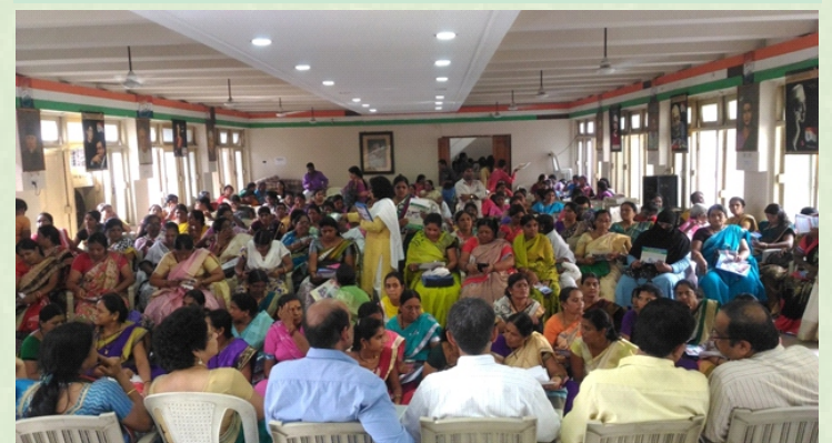
Training program for women organized at Nagpur on September 29, 2016