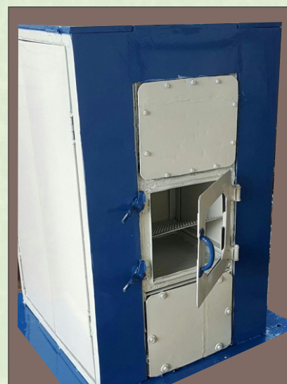
Cotton lint opener

Cotton lint samples from densely packed bales should be properly opened and cleaned for accurately measuring the fibre quality parameters using High Volume Instruments. Presently, testing laboratories either employ human labour or use trash analyzer for the purpose of opening cotton lint samples for testing. In both these methods, the extent of lint opening is not uniform or optimum and the speed is also very slow. Therefore, a new device has been designed to give uniform and desired lint opening at faster rate without any damage to the cotton fibres. The research prototype of the lint opener has been fabricated and tested for performance evaluation.