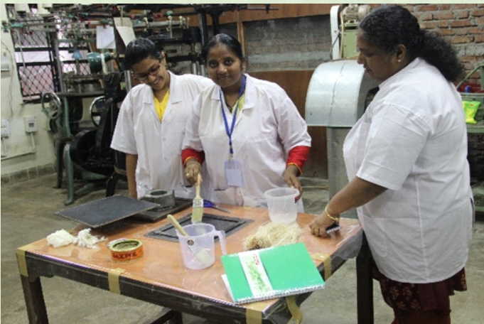
Hands-on practical training on preparation of nano composites