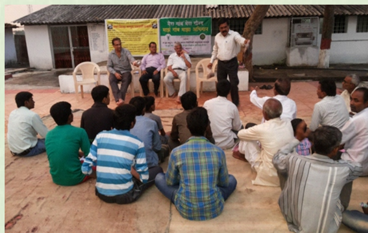
Mera Gaon Mera Gaurav programme at Sonegaon, Wardha on September 26, 2016