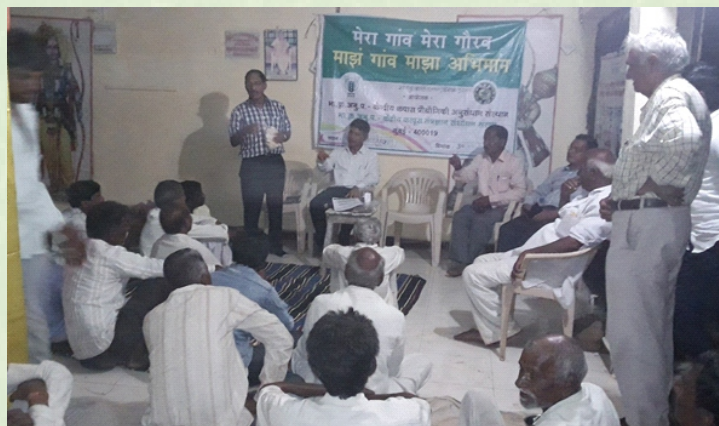
Mera Gaon Mera Gaurav programme at Selukate, Wardha on September 30, 2016