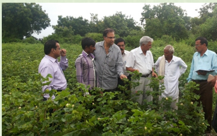
Experts during interaction with farmers in farmers field at Murajgaon village on September 26, 2016