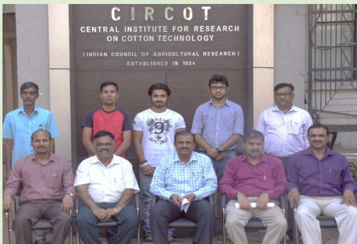
Group photo of a training programme on Quality Evaluation of Cotton organized during September 26-30, 2016

In line with the skill development initiative of the Govt of India, a five day training programme on “Quality Evaluation of Cotton” was organized during Sept. 26-30, 2016 at Mumbai for participants from the Cotton Trade and Industry. This programme focussed on basics of cotton grading, quality evaluation & its importance in trade. Practical classes and demonstrations on cotton quality assessment, cotton grades, spinning and yarn testing were also conducted. In addition, a visit to Cotton Association of India was arranged to expose the participants to commercial grading of cotton.