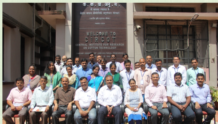
Group photo of trainees of the ICAR short course held during September 19-28, 2016