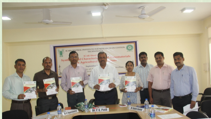
Release of the training manual: ICAR short course on synthesis and characterization of nano materials for agricultural applications