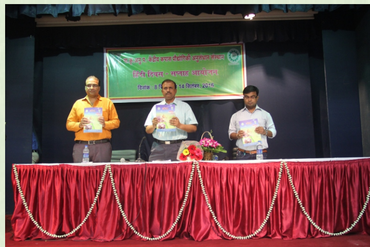
Hindi magazine AMBER being released on September 14, 2016