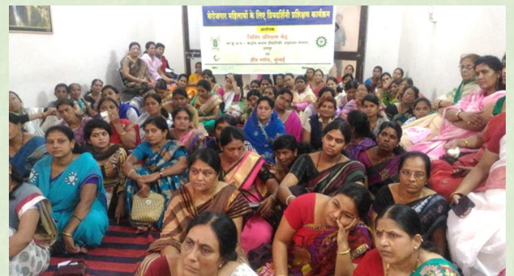
Training program for women organized at Amravati on September 28, 2016