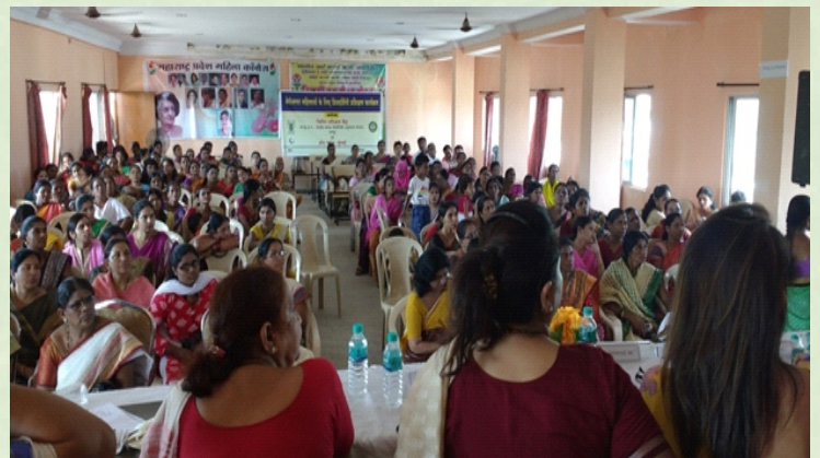
Training program for women organized at Wardha on September 27, 2016

of women farmers. The programme covered topics like cultivation of oyster mushroom using cotton stalks, surgical cotton preparation, poultry feed from cotton seed meal and preparation of briquettes and pellets from cotton and other agro residues. Dr S.K. Shukla, In-charge, GTC, Nagpur briefed about the institute research activities and utilization of cotton stalks and other agro residues to increase farm income. Demonstrations on preparation of value added products from cotton stalks were also conducted.